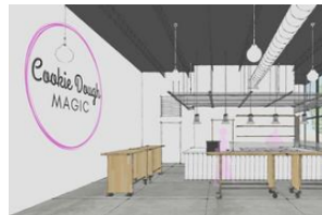
DESIGN INITIATIVE A rendering of the Cookie Dough Magic space at the 400 41st project in Avondale.