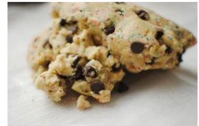
PIXHERE Cookie Dough Magic is opening in Avondale in August.