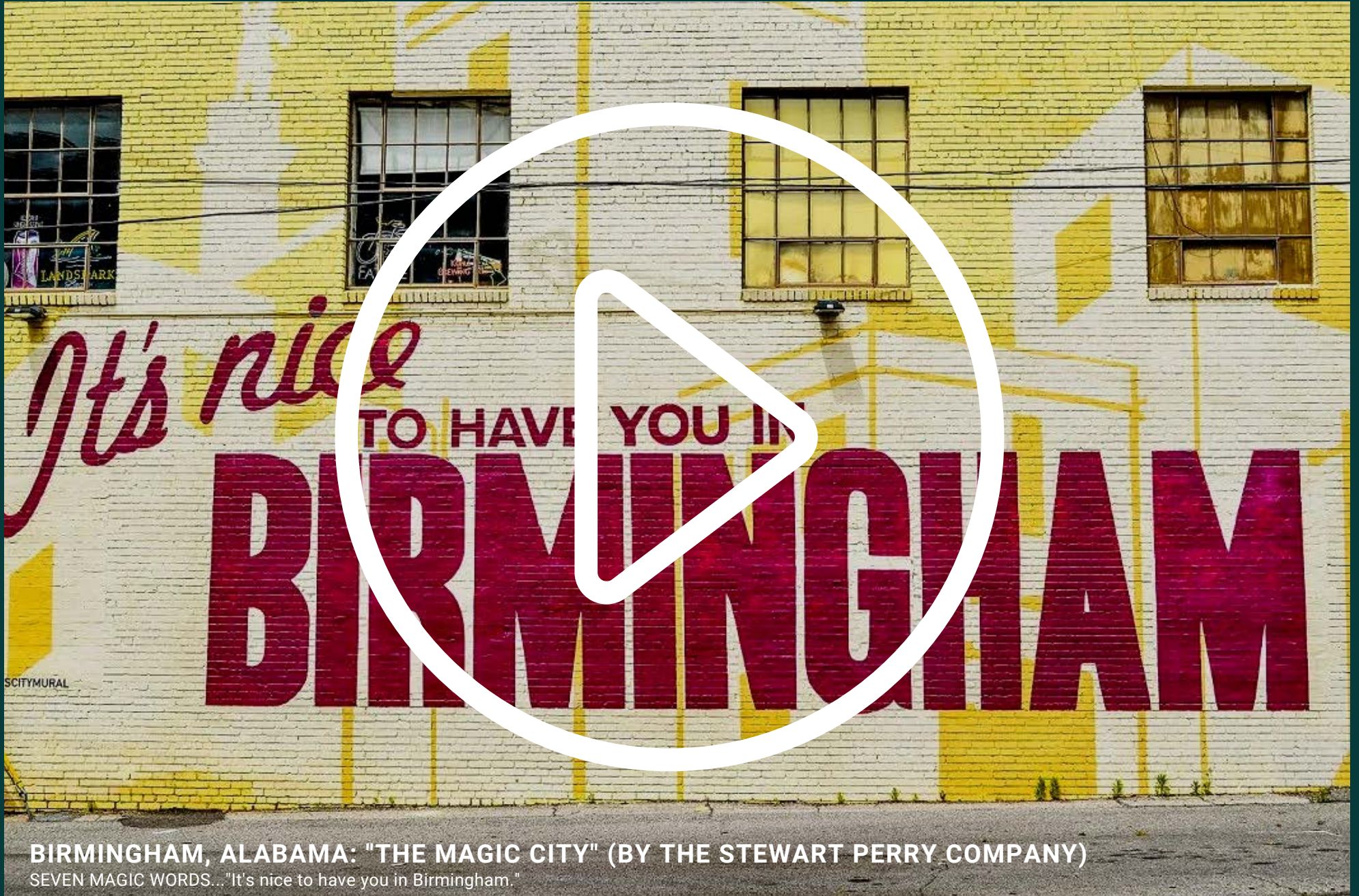
BIRMINGHAM, ALABAMA: "THE MAGIC CITY" (BY THE STEWART PERRY COMPANY) SEVEN MAGIC WORDS... "It's nice to have you in Birmingham."